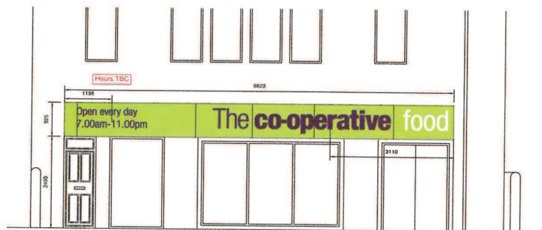
ELEVATION 1 - SIGN A 393mm MS letters SCALE 1:50